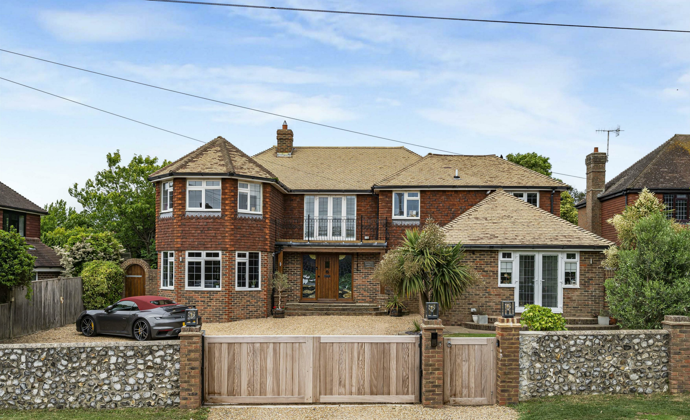
Cuckmere Cottage Cuckmere Road, Seaford, East Sussex, BN25 4DG